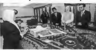
Prime Minister Narendra Modi with Indonesian President Joko Widodo during a visit to Istiqlal Mosque in Jakarta, Indonesia on Wednesday.

Prime Minister Narendra Modi on Wednesday paid a visit to Indonesia's grand Istiqlal Mosque, the largest in Southeast Asia, during his first official visit to the country.