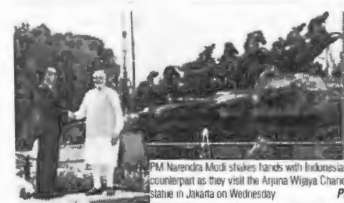
PM Narendra Modi shakes hands with Indonesian counterpart as they visit the Arjuna Wijaya Cultural Centre in Jakarta on Wednesday.

Peshawar: A day after the killing of a renowned Sikh religious leader and rights activist by gunmen here, an investigation committee, headed by a senior Superintendent of Police, was on Wednesday set up to probe the incident that has jolted the minority community in Pakistan.